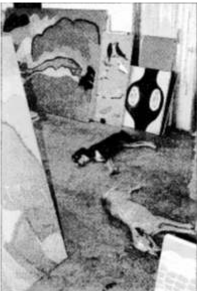
Warmun art and its guard dogs.