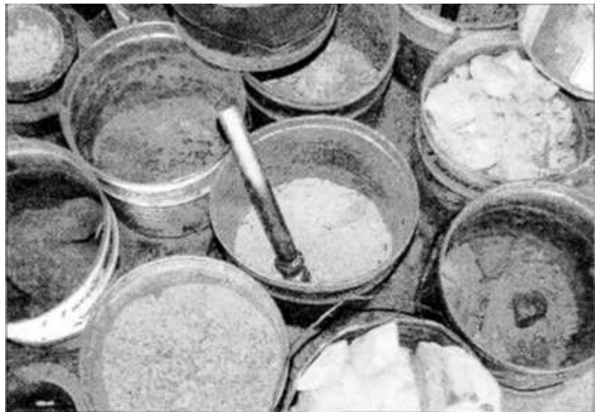
Warmun artists use natural ochres, which they collect over a 300km radius.