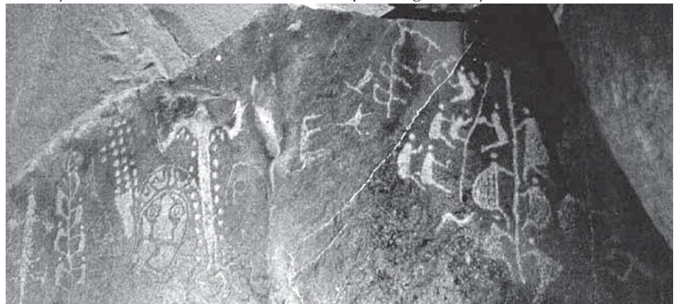
Burrup rock art - 'Climbing Men'

Earlier this year, I spoke in Parliament on the need to protect the rock art and since then I have pushed the issue publicly and through the media. For a copy of my speech, please go to my website.