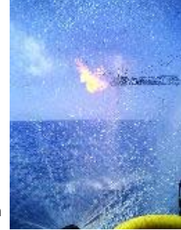
Pluto well test

Minimum targets were also set for indigenous participation in the project, including in the construction and operational workforce and local supply contracts to encourage the long-term development of the local indigenous community.