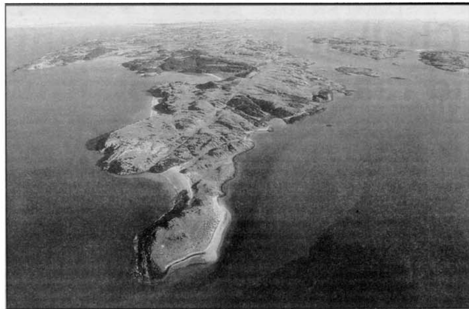
The Burrup Peninsular Islands, looking from the north towards Karratha.

"When we think of standing stones, we think of things like