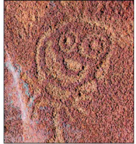
Etched in stone: Aboriginal rock art at Western Australia's Burrup Peninsula is thought by some to be the world's oldest