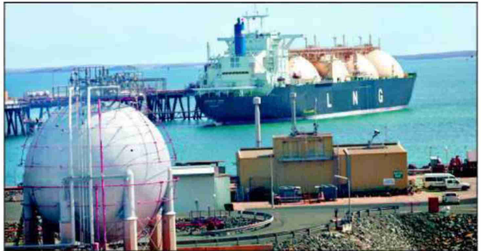
Trouble brewing: A proposed expansion of the North West Shelf gas plant worries activists