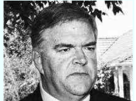
Bowing out: Former Labor leader Kim Beazley

■ Mainly a suburban seat involving heavy industry in the Kwinana area, alumina refining, tourism and the HMAS Stirling naval base on Garden Island