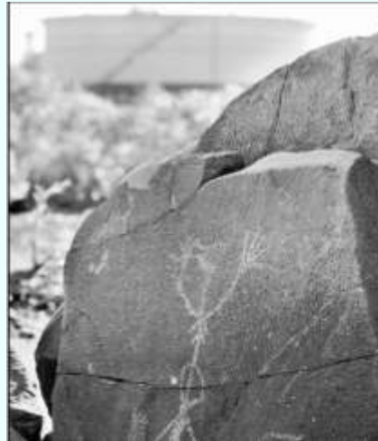
Safeguard: Rock art in 241sqkm of the Burrup will be protected..

"It would have taken uncommon courage for the Minister to protect the full scope of the Burrup art against the