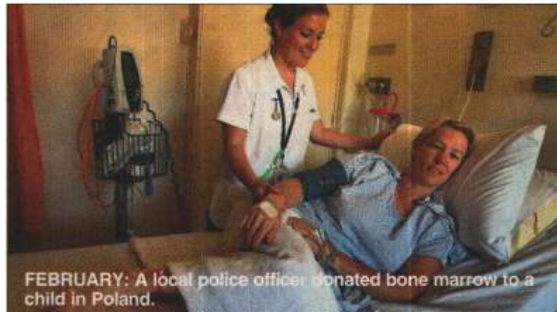
FEBRUARY: A local police officer donated bone marrow to a child in Poland.