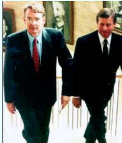
Richard Court and Colin Barnett